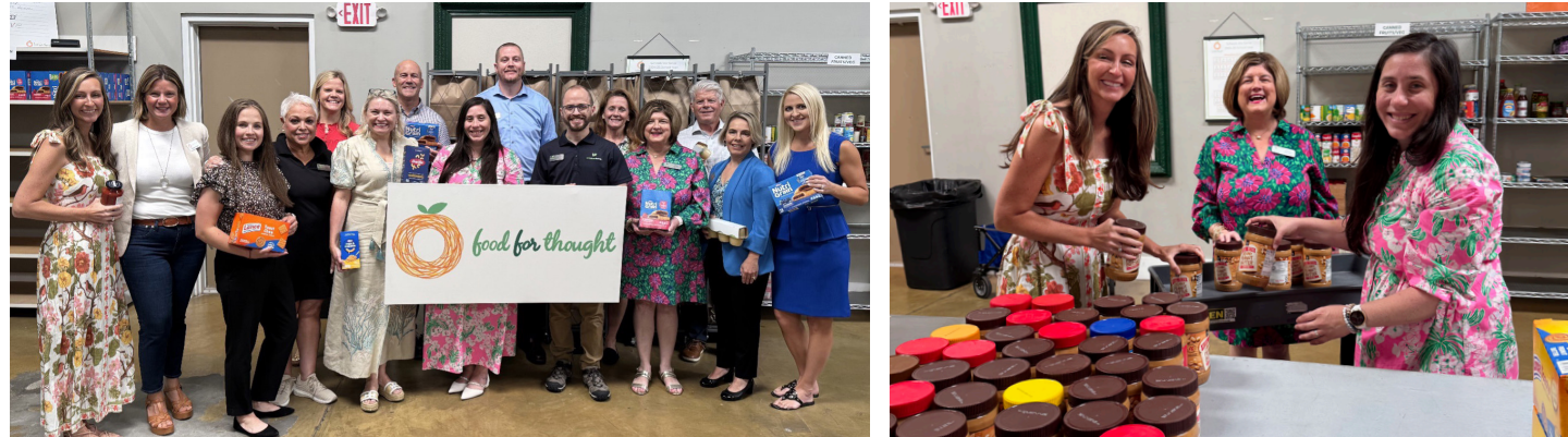
Volunteer Florida Leadership and Commissioners pack food boxes at Food for Thought in Santa Rosa Beach during our annual commission meeting.

Volunteer Florida is committed to serving Florida both through its programming and through direct service. Our board members, leadership and staff are committed to making Florida a great place to live through their consistent service throughout many Florida communities.