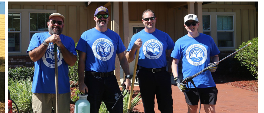
RCAF funding helped provide equipment for volunteers in several organizations