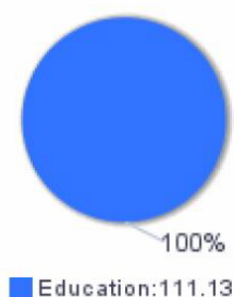
Table 1: MSYs by Focus Areas