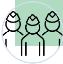
Veterans and Military Families

Our programs serve as a pathway to employment opportunities and help develop vital work skills. We build and rehabilitate affordable housing, provide financial literacy training, and connect people to jobs.