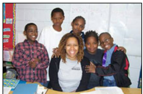
Of Volunteer Florida's AmeriCorps members 67% (or 591 individuals)