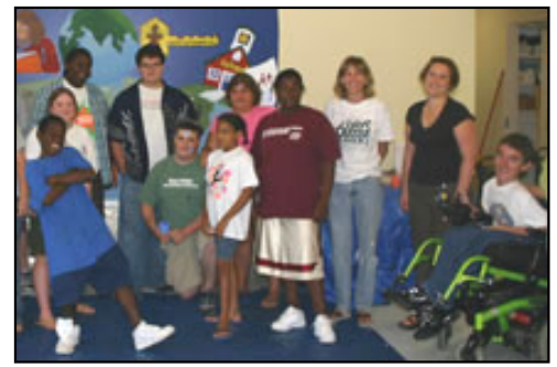
Project Impact is just one of Volunteer Florida's many programs that introduce people with disabilities to volunteerism and service in their community.