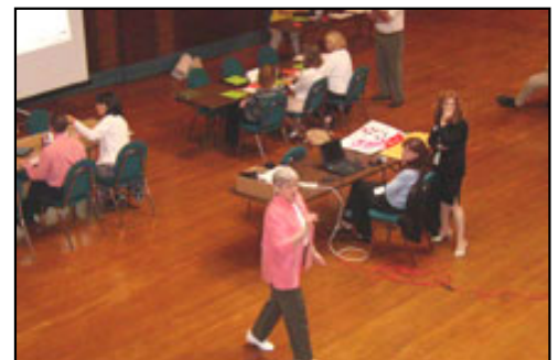
COOP and Unaffiliated Volunteer Management Training provided to National Service leaders at the 2006 Multi-State Cross-stream Conference in Atlanta; and