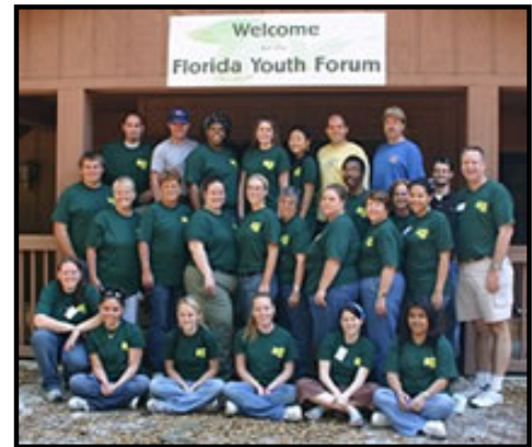
More than 30 youths and their adult mentors attended the Florida Youth Forum, held at Camp Wewa in Apopka March 3 - 4.